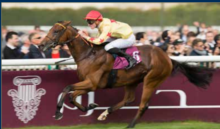
ANGEL FALLS dam of NATIONAL DEFENSE winner of Prix Jean-Luc Lagardere, Gr. 1 sold at Tattersalls July Sale by Darley to BBA Ireland for 80,000 gns