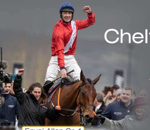
Envoi Allen Gr. 1