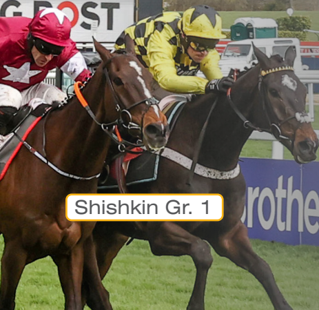
Shishkin Gr. 1