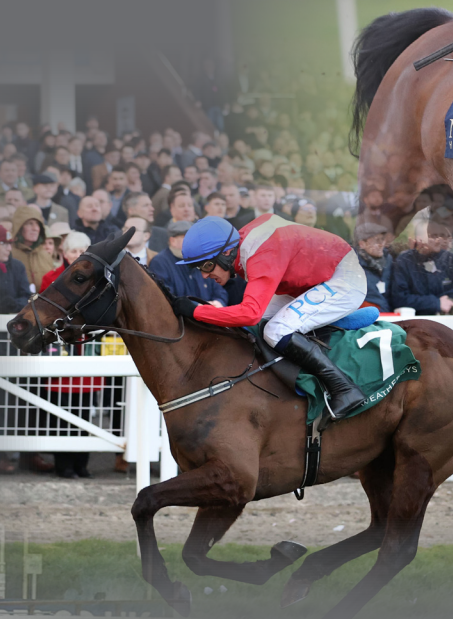
Ferny Hollow Gr. 1