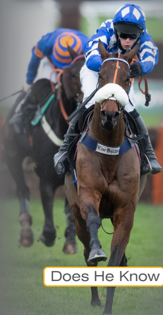
Does He Know