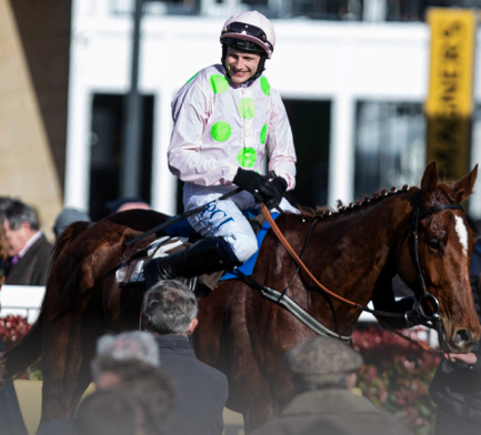
Monkfish Gr. 1