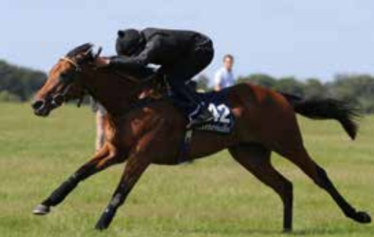
TOP OF THE POPS winner of a £15,000 Craven Breeze Up Bonus and a £25,000 Tattersalls October Book 1 Bonus