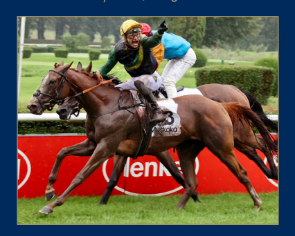
MORNING MIST dam of MUSKOKA winner of Preis der Diana, Gr. 1, etc. sold Tattersalls February Sale by Brook Stud to Axel Donnerstag Bloodstock for 2,200 gns