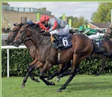
UBETTABELIEVEIT beats Gr.1 winner WINTER POWER and 3 other Group winners.